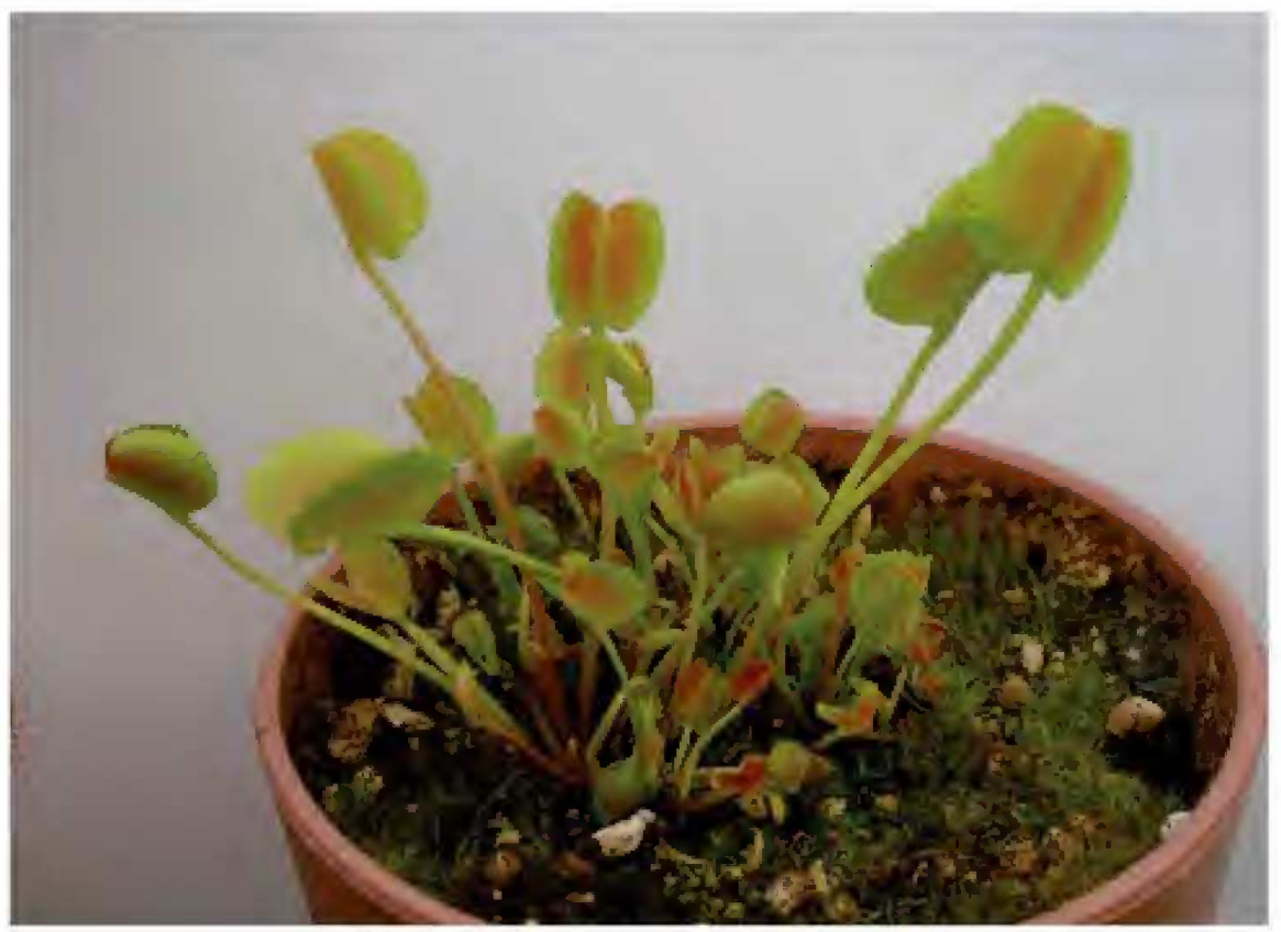
Figure 14: Dionaea 'Korean Melody Shark'.

By germinating 100 seeds after asepsis, one plant appeared to be different from the other ninety nine. We separated this unique plant and mass propagated it. It seems like this cultivar, which we named Dionaea 'Korean Melody Shark,' is a sterile mutant—after growing the cultivar and finally seeing its flower, we discovered that the pistil and stamen do not reach maturity. Therefore, we could not collect any seeds. It is thus only possible to multiply the cultivar by dividing the rhizomes.